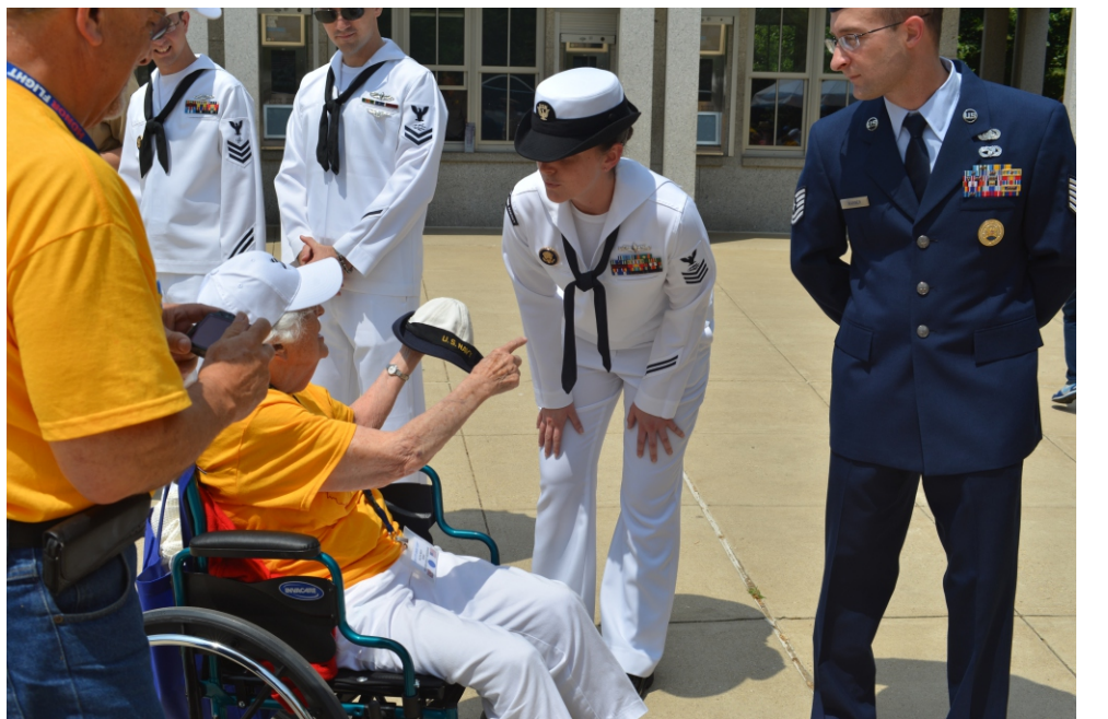
Active military on hand to assist and show respect for our veterans.