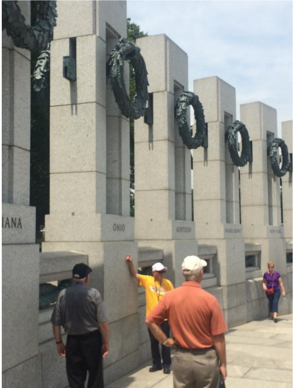
Local veterans visit the World War II memorial as part of their annual visit to Washington D.C.

This marks the fourth full Honor Flight organized by Flag City Honor Flight enabling hundreds of veterans to visit the memorials in their honor in Washington D.C.